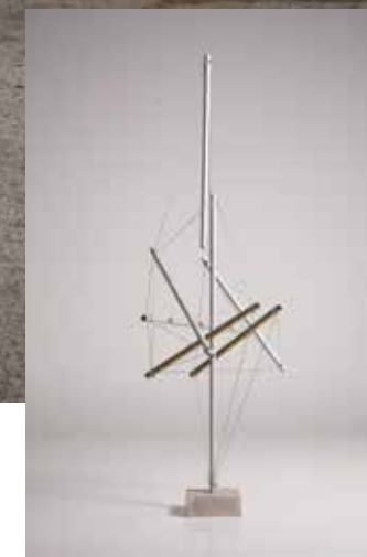
Vol. 3 2022. aluminij, mesing, čelik aluminium, brass, steel vis. / h. 46 cm