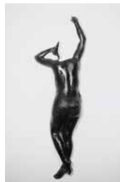
Odozgo / From Above 2020.–2022. sedmerodijelni ansambl / seven-piece ensemble poliester / polyester prirodna veličina / life size