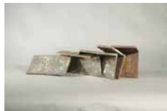
Ravno do dna / Straight to the Bottom 2022. sedmerodijelni ansambl / seven-piece ensemble metal, ogledalo / metal, mirror vis. / h. 75 cm; 44 cm; 27 cm; 57 cm; 28 cm; 35 cm; 22 cm